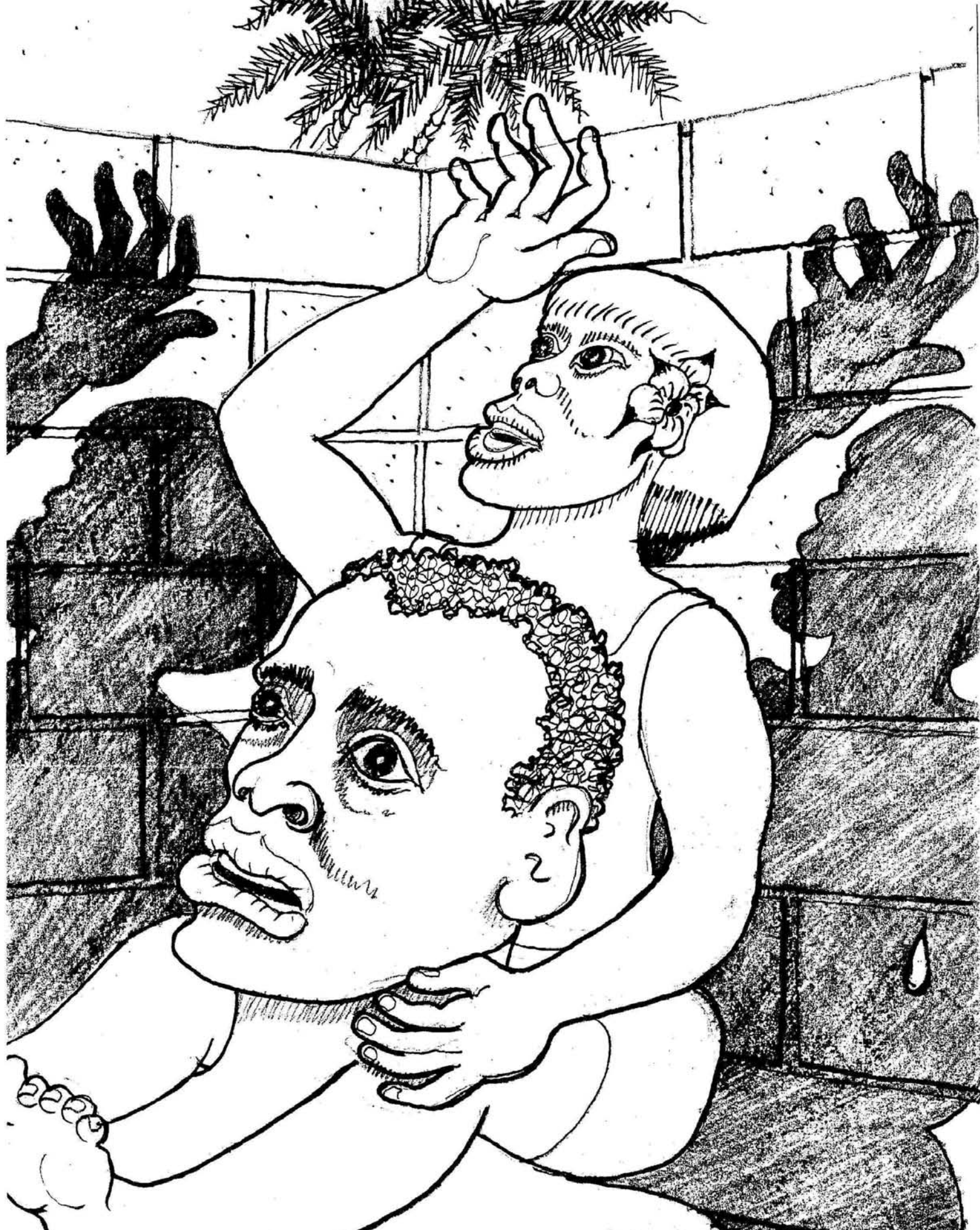
“TWO SHADOWS” A FLASH BRIGHTER THAN RAKAHANGA 1958